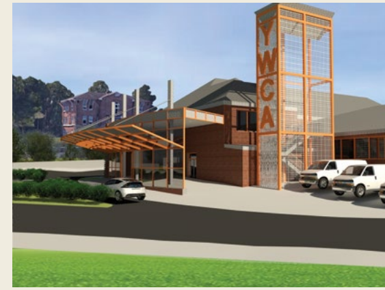
A rendering of the revitalized Phillis Wheatley YWCA on Atlanta's west side.